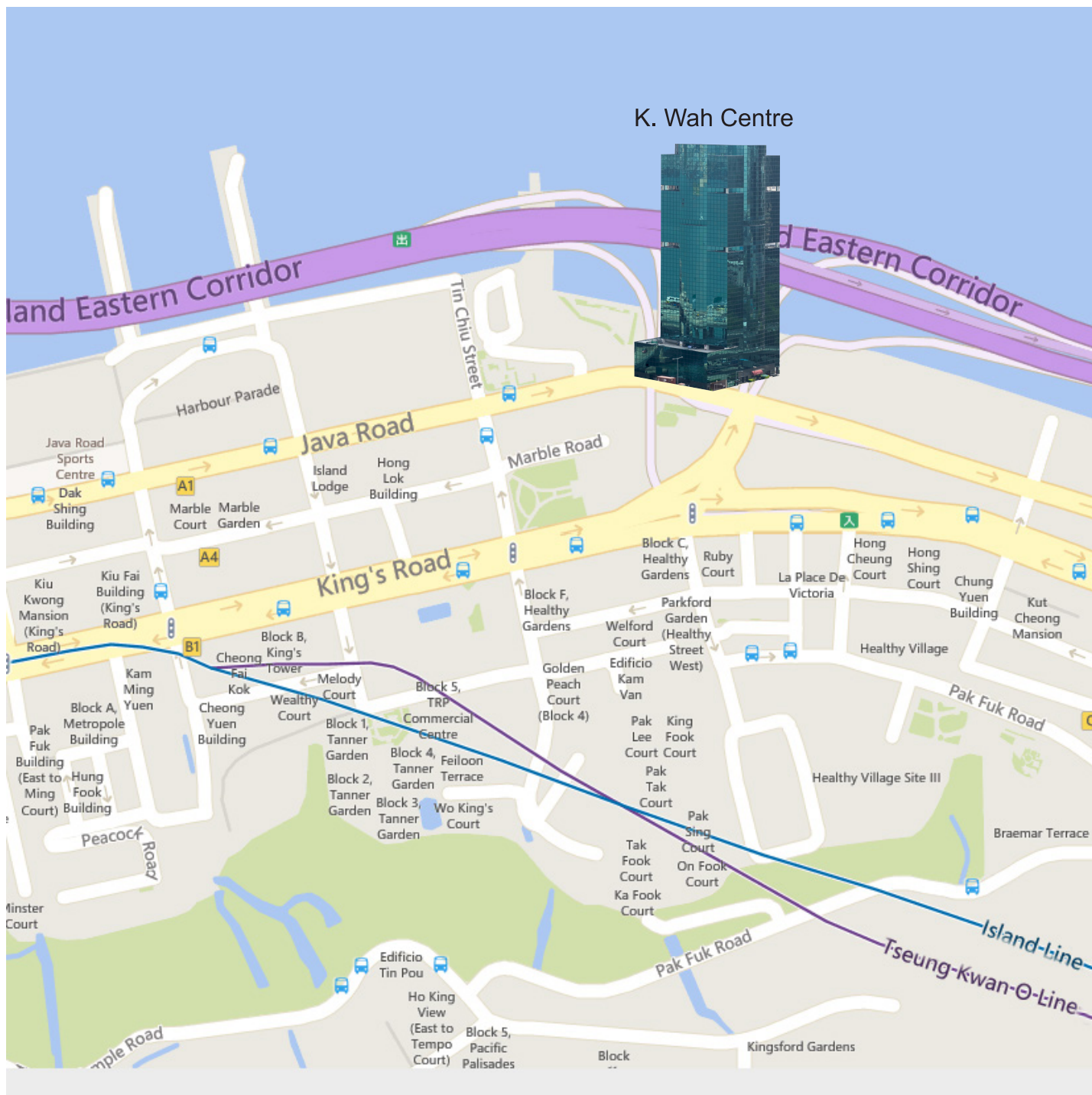
K. Wah Centre

KW 嘉華地產(集團)有限公司 K. WAH PROPERTIES (HOLDINGS) LTD.